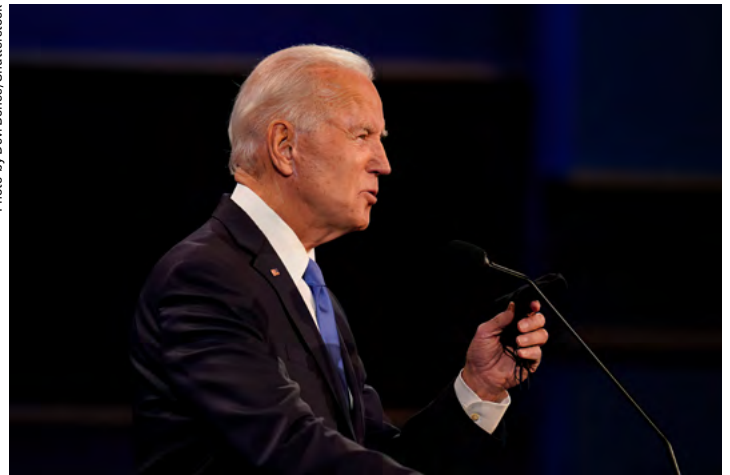
President Biden previously pledged to "end the Trump administration's historic use of 287(g) agreements."