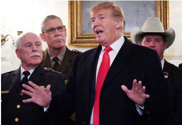
President Trump speaks at the White House.