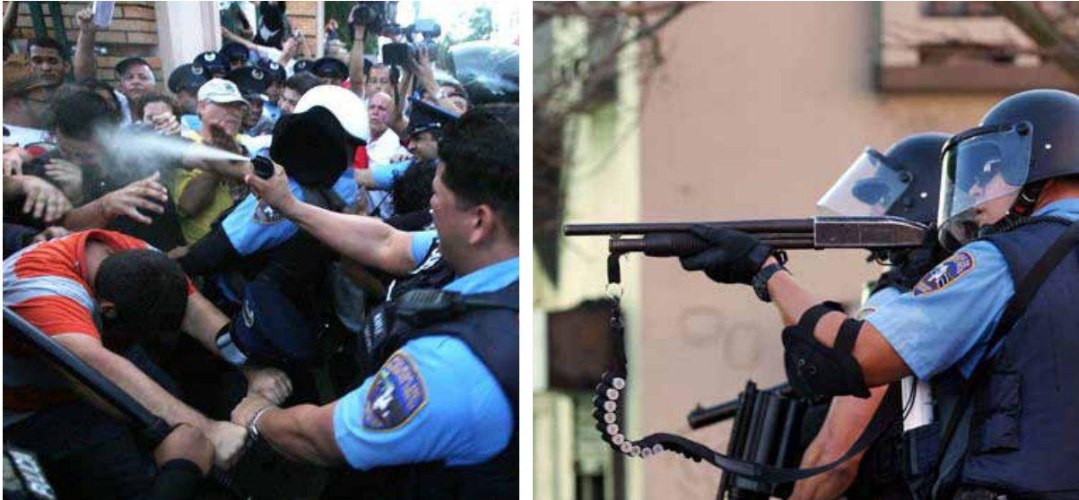
Left, police pepper-spray student protesters on the University of Puerto Rico campus during the April 2010 student strike. Right, a PRPD officer shoots rubber bullets at student protesters.

points. Pressure point tactics not only cause excruciating pain, but they also block normal blood flow to the brain and can be potentially fatal if misapplied. In some cases these pressure point techniques have caused student protesters to lose consciousness.