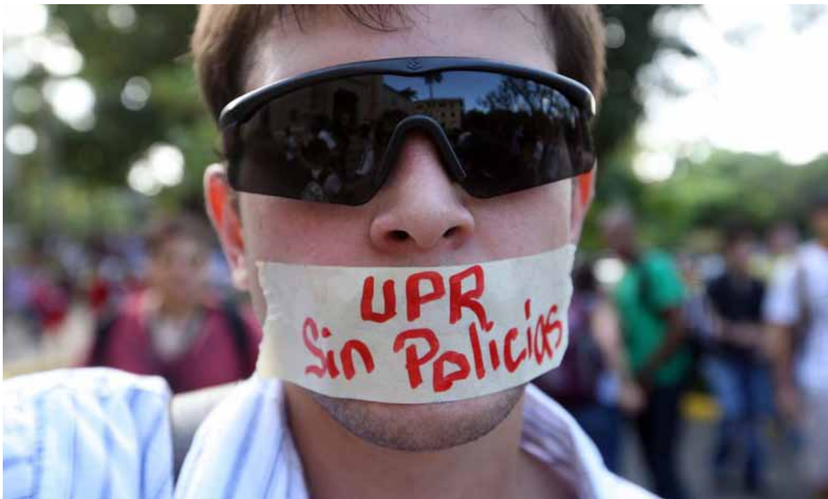
A protesting University of Puerto Rico student demanding the removal of police from the university campus. The tape on his mouth reads, "UPR Without Police."

Based on our research, including our findings identifying a number of problematic policies and practices that contribute to the pattern of police abuse in Puerto Rico, we have formulated clear recommendations for much-needed reforms. These reforms will not only help to bring the Puerto Rico Police Department into compliance with the constitutions of the United States and Puerto Rico and human rights laws, but will also help it to combat the public safety crisis it currently confronts.