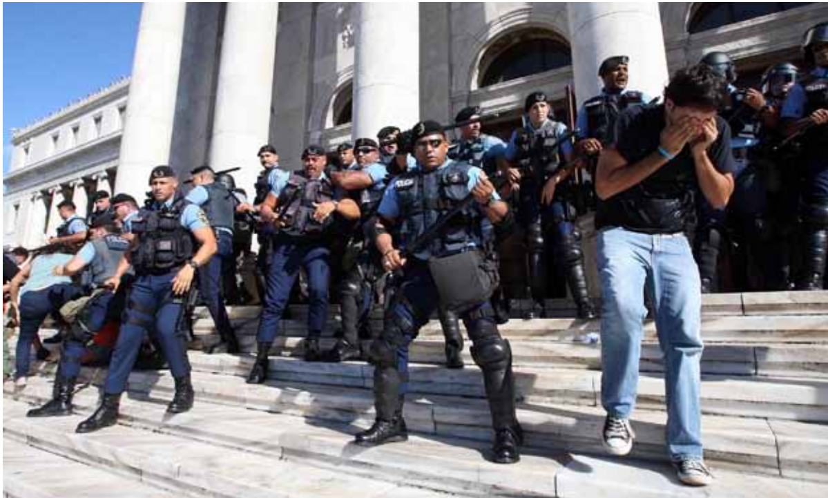
Riot Squad officers violently attacked protesters and independent and student journalists with pepper spray and batons on the steps of Capitol Building on June 30, 2010.

After a comprehensive six-month investigation of policing practices in Puerto Rico, building on eight years of work by the ACLU of Puerto Rico documenting cases of police brutality, the ACLU has concluded that the Puerto Rico Police Department commits serious and rampant abuses in violation of the United States Constitution, the Puerto Rico Constitution, and the United States' human rights commitments.