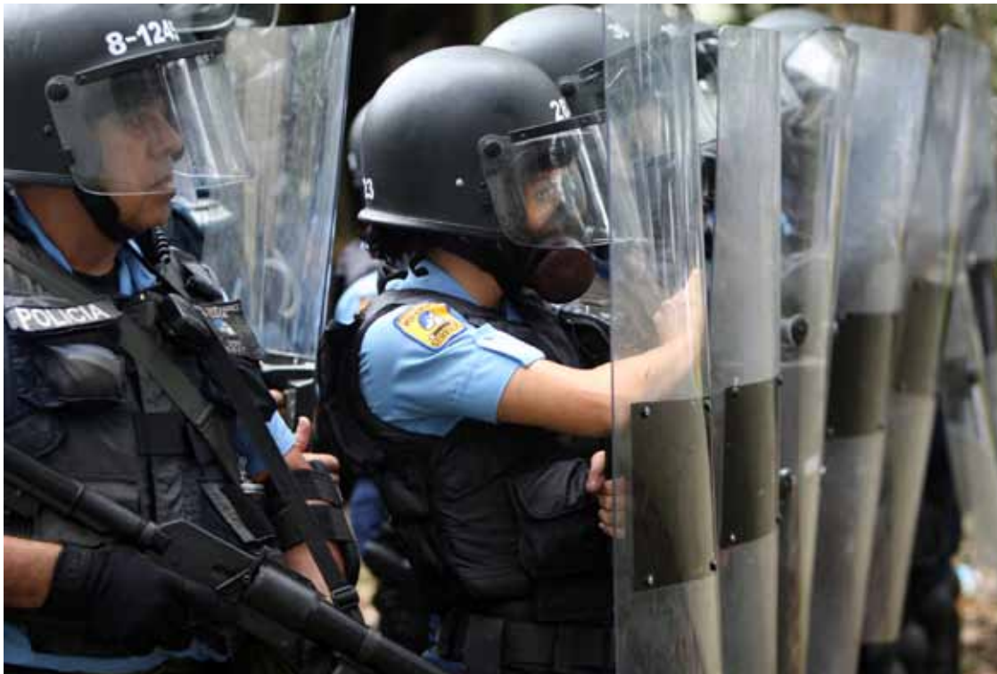
Riot Squad officers in formation while protesting students march on the University of Puerto Rico campus during the December 2010 student strike.

The Puerto Rico Police Department is the second-largest police department in the United States. It has been plagued by pervasive corruption, domestic violence, and other crime within the police force. The high incidence of criminal conduct among the PRPD's ranks is symptomatic of a larger institutional dysfunction of the police department's policing and disciplinary systems.