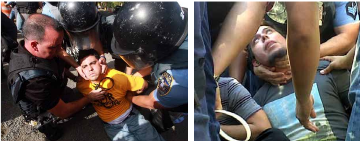
PRPD officers used painful pressure point techniques on passively resisting student protesters, in which officers targeted protesters' carotid arteries, under their jaws, near their necks, their ears, or directly on their eyeballs.

The students then moved onto Avenida Constitución, directly behind the Capitol complex, and some students began a sit-in on the public street, partially blocking traffic, while others continued to chant and hold placards. As soon as the smaller group of students began their sit-in at the Avenida Constitución, police officers began arresting those engaging in the sit-in one by one. The police never advised the students where they should move, and never told them they could protest in another location, but rather merely ordered them to “get out.” 260