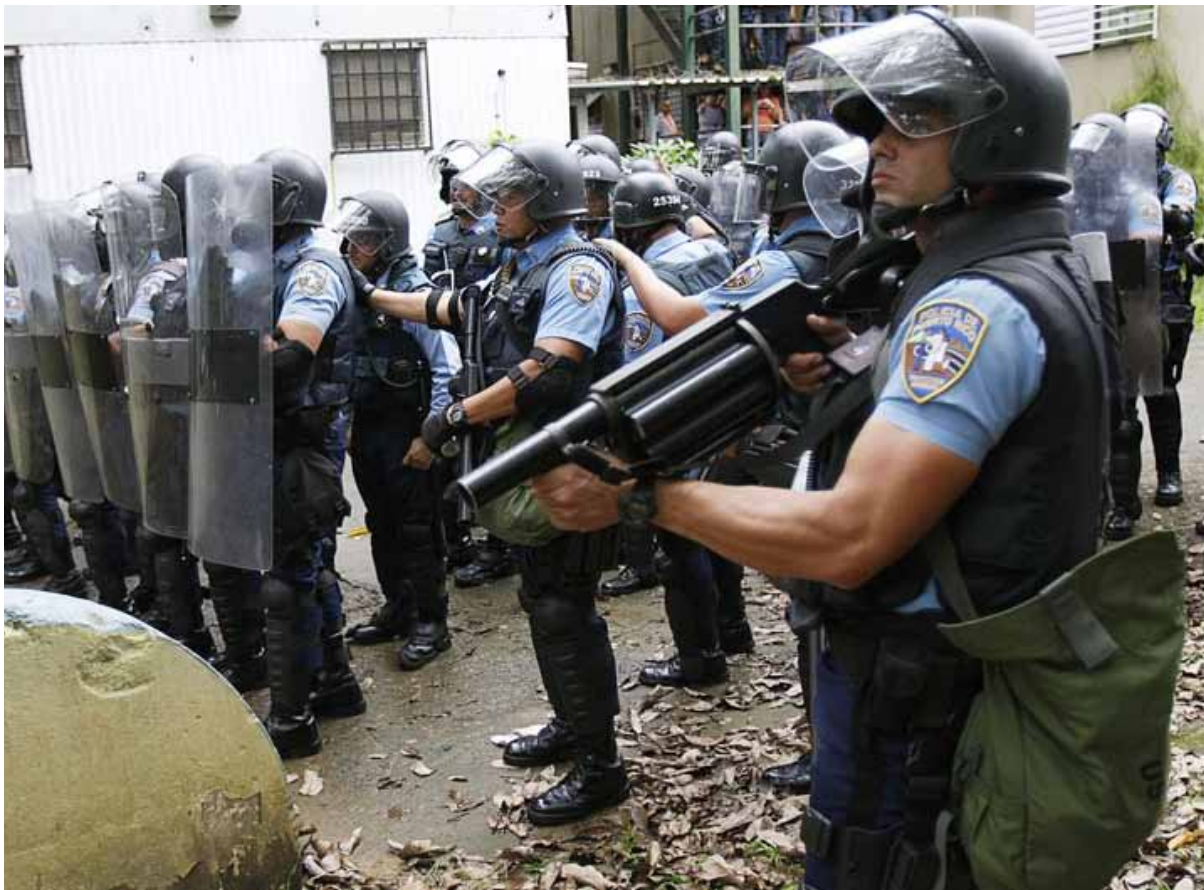
Riot Squad officers in formation on the University of Puerto Rico campus while students march in protest. An officer in the foreground holds a riot gun that fires aluminum canisters of tear gas.

The Puerto Rico Police Department frequently and systematically uses excessive force against protesters. Officers indiscriminately used a toxic form of tear gas, pepper spray, batons, rubber bullets, stinging ball grenades, Tasers, carotid holds, and painful pressure point techniques on protesters.