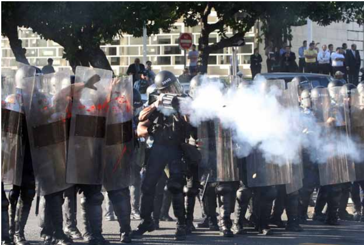
Riot Squad officers indiscriminately fire tear gas and rubber bullets at peacefully protesting students on the University of Puerto Rico campus in February 2011.

The Puerto Rico Police Department fails to provide even basic guidance to its personnel on how to discharge their duties in compliance with the Constitution. The PRPD lacks standard protocols on the use of force and officers receive patently inadequate training, insufficient supervision, and minimal guidance on the legal boundaries of their use of force and other conduct. There is minimal transparency and no effective independent review of the PRPD's policies and practices.