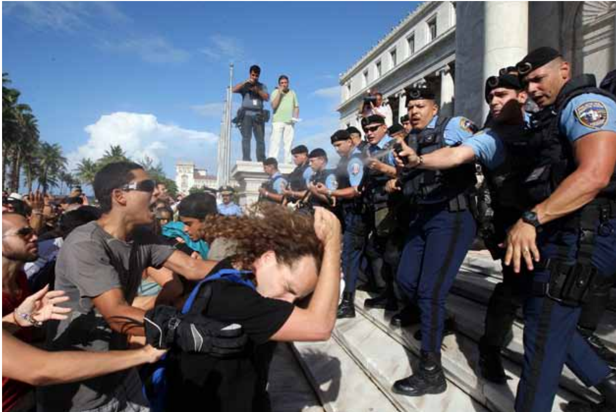
Riot Squad officers on the steps of the Capitol Building pepper-spray protesters during the June 30, 2010 mass public protest. Photo Credit: Andre Kang / Primera Hora (2010)

In responding to entirely peaceful or largely peaceful political demonstrations at locations that are traditionally the site of public protest in Puerto Rico, police have systematically used excessive force to suppress constitutionally protected speech and expression. The PRPD has regularly responded to protests by deploying scores of Riot Squad officers in full riot gear, who routinely struck protesters with batons, sprayed protesters with pepper spray at close range, fired tear gas indiscriminately, and used painful pressure point techniques on passively resisting students.